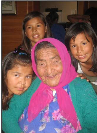
Young and old at Bible Camp NWT, 2010