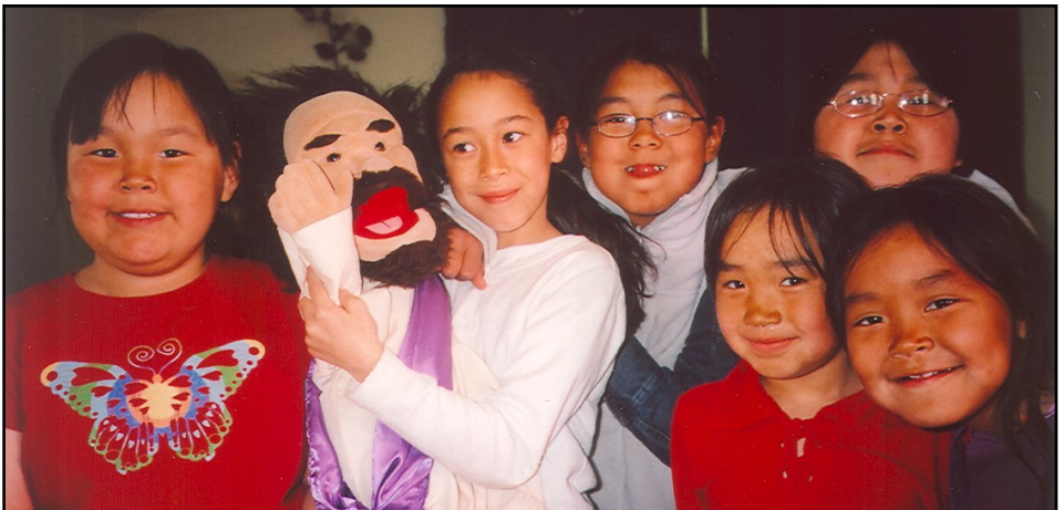
Having fun with a Jesus puppet in Resolute Bay, NU, early 2000s.

Day 5: The Gift of New Life will focus on the Easter story. How Jesus gave his life for those he loves, and how he invites us to experience his life-giving power every single day!