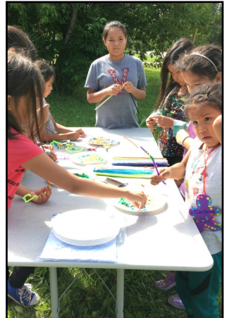
Outdoor craft time NWT, 2015